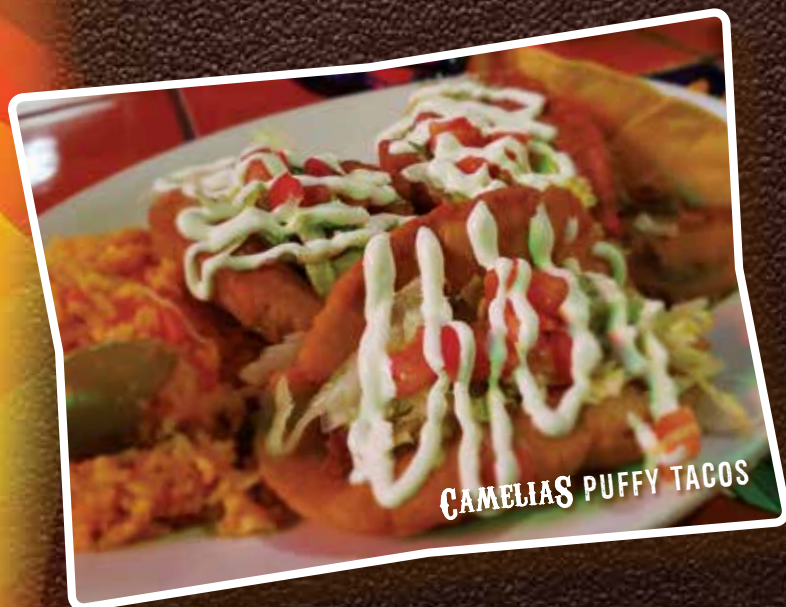
CAMELIAS PUFFY TACOS

Three lightly fried corn tortillas stuffed with your choice of chicken, ground beef or cheese. Topped with our own blend of seasoned pinto bean salsa, queso fresco, cilantro and chorizo – 14.49